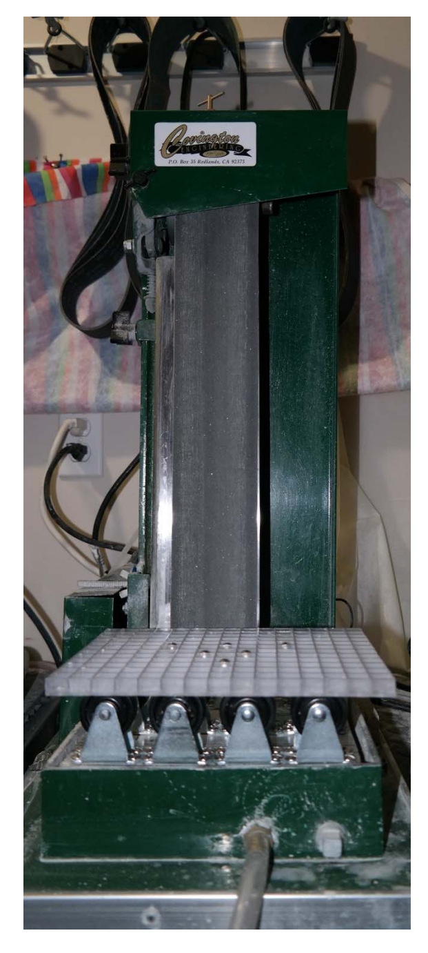
Waffle Grid with ball bearings on conveyor